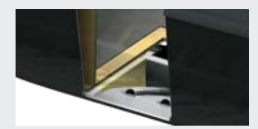
INJECTION FLOTATION FOAM On a Starweld foam is injected, not poured, between the floor and hull — filling all air pockets. This provides greater strength and buoyancy and reduces noise.