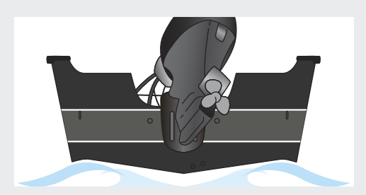
REVERSE CHINE HULL The Starweld full-length reverse chine hull pushes water down and away from the boat, for quicker planing, improved cornering and a smoother, drier ride.