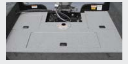
AFT CASTING PLATFORMS Because Starweld boats are all about fishing, they have the largest aft casting platforms in their class.