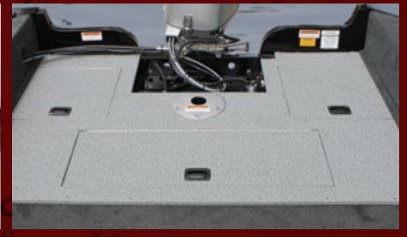
boats are all about fishing, they have the largest aft casting platforms in their class.