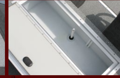
AERATED LIVEWELLS are designed for convenience and to protect your catch. (See model lineup for location and sizes)