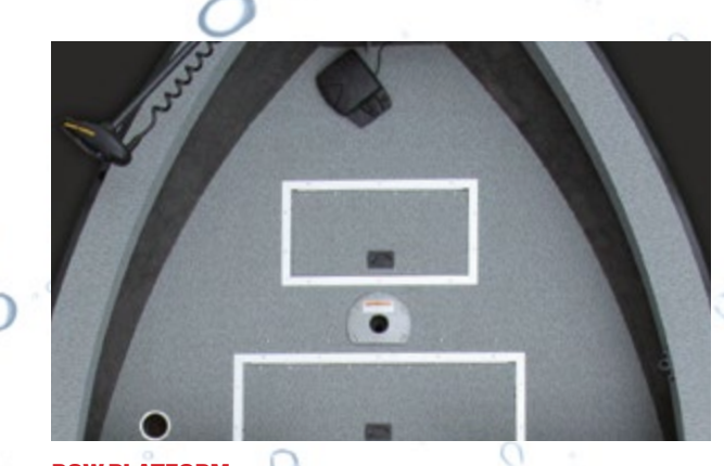
BOW PLATFORM Starweld Pro models feature some of the largest bow casting platforms in the industry, with large aerated livewells and dry storage.