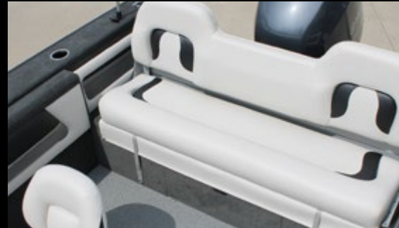
STERN FLIP-UP BENCH SEA